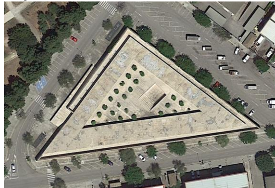
Centre Bit Raiguer, Inca.

The Conference will be held at the Centre Bit Raiguer . This is the headquarters of the Balearic Islands Natural Hazards and Emergencies Observatory - RiscBal . The site has a large conference room and all the necessary facilities.