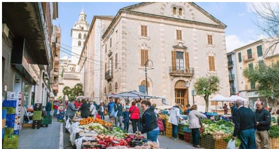
Market day in the city of Inca.

industry and also an important economic development center.